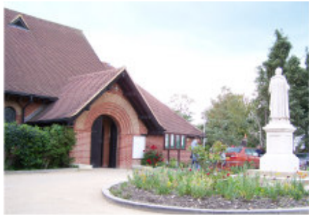
Solemnity of Corpus Christi