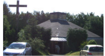
14 th June 2009

Youth led Mass. Thanks to all involved with preparing for and participating in the lovely Mass last Sunday. It is good to see so many young people taking an active part.